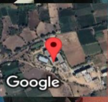
Bhojan Rathod, Gujarat, India 6gmr+mv2, Bhojan Rathod, Gujarat 382422, India Lat 23.234409° Long 72.542074° 17/04/2025 03:41 PM GMT +05:30